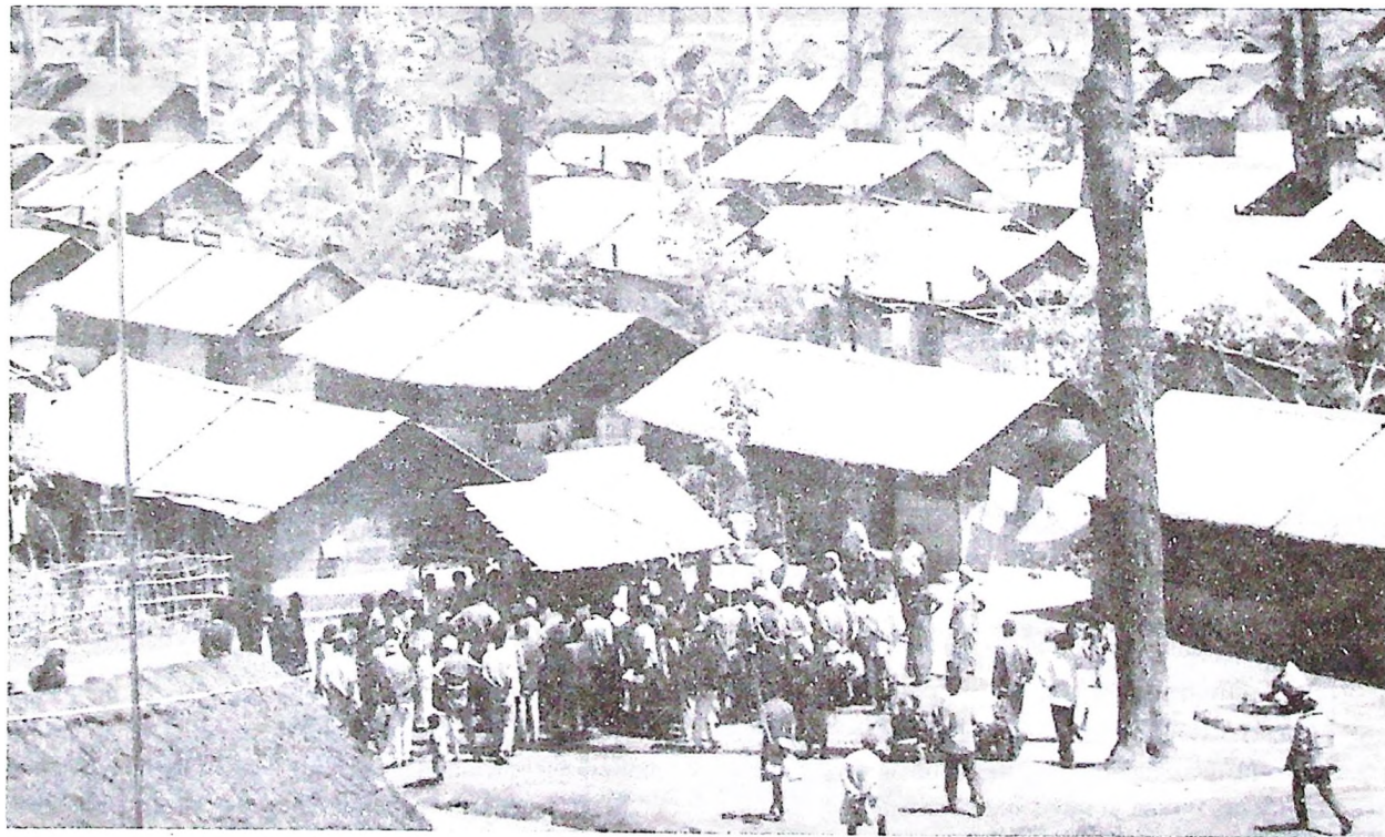
A refugee camp in Jhapa